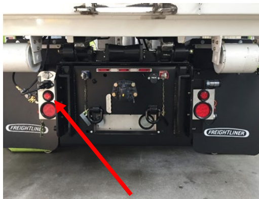
BODY AIR AND LIGHTING CONNECTIONS